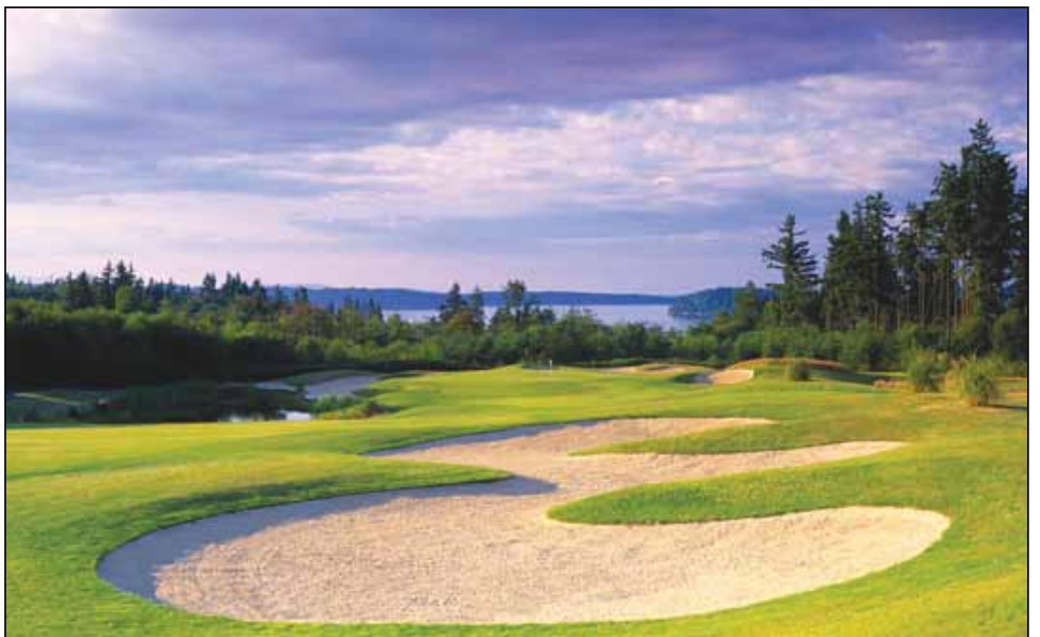
The Golf Club at Hawk's Prairie offers two distinctly different courses, the Woodlands and The Links Course (above), both are great courses to play.