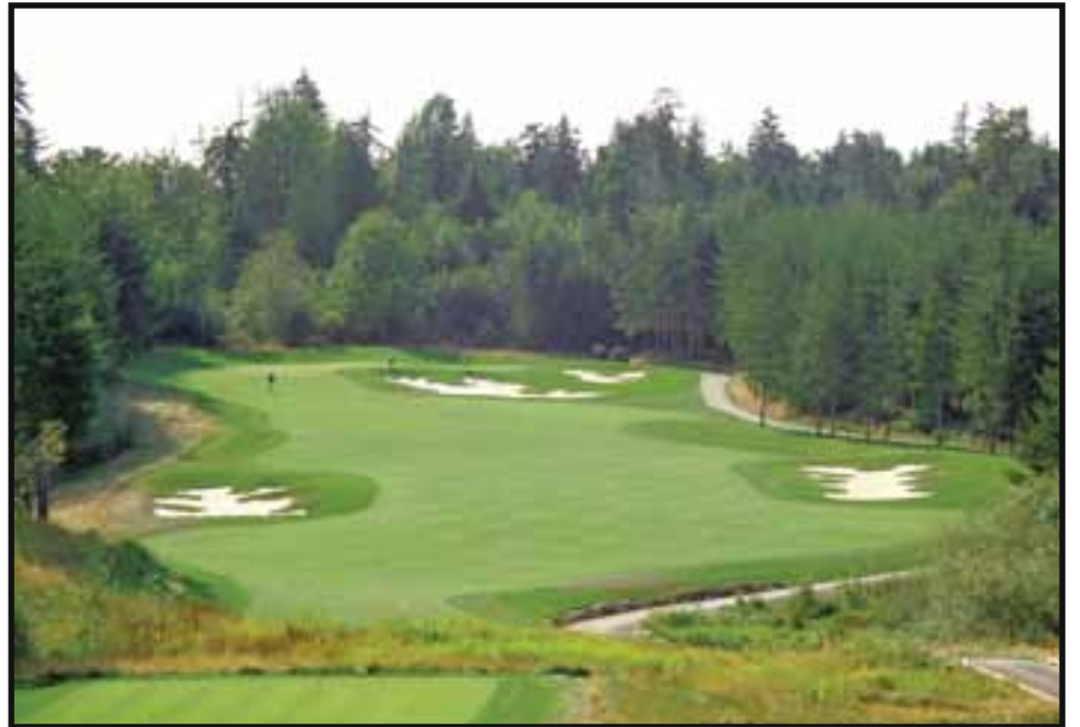
Salish Cliffs Golf Club is part of the Little Creek Resort, owned by the Squaxin Island tribe.

As part of the Oki Golf umbrella, there are many ways to save and play the Hawks Prairie courses. A variety of membership plans and options can be found on their website: www.okigolf.com .