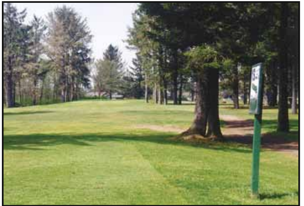
Ocean Shores Golf Course's back nine contrasts the front nine with tree-lined fairways.