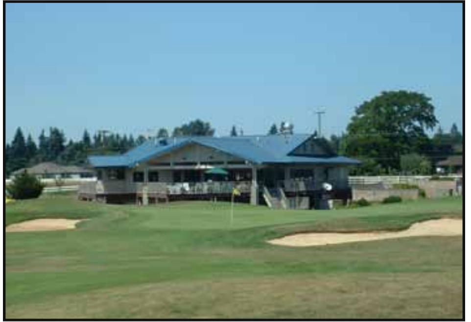
Tri Mountain Golf Course gets its name from Mt. St. Helens, Mt. Adams and Mt. Hood.

The Home Course is a treat with superb conditions, some great views of the Puget Sound along the way and some challenging holes. If you want