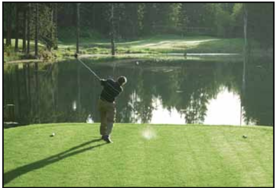
Skamania Lodge Resort's golf course is a par-70 tucked away in a wooded setting.