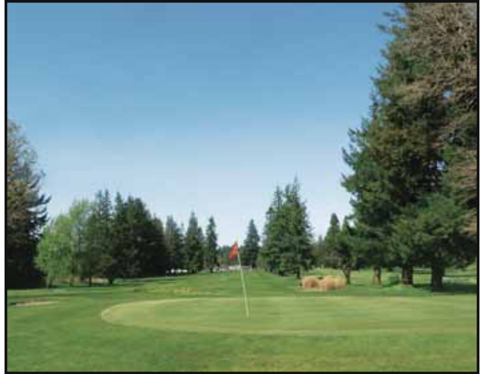
For a place to play on the way to the Washington Coast, Oaksridge in Elma is the place.