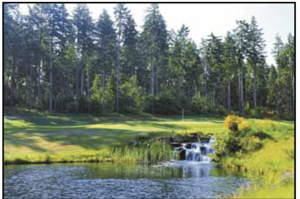
The Woodlands Course (above) and The Links Course make up the Hawks Prairie courses.