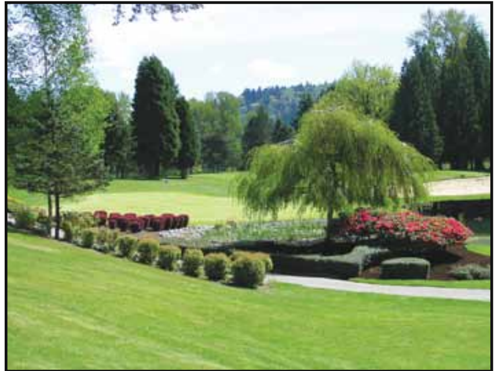
Lewis River Golf Course in Woodland offers an 18-hole golf treat like a walk through a park.