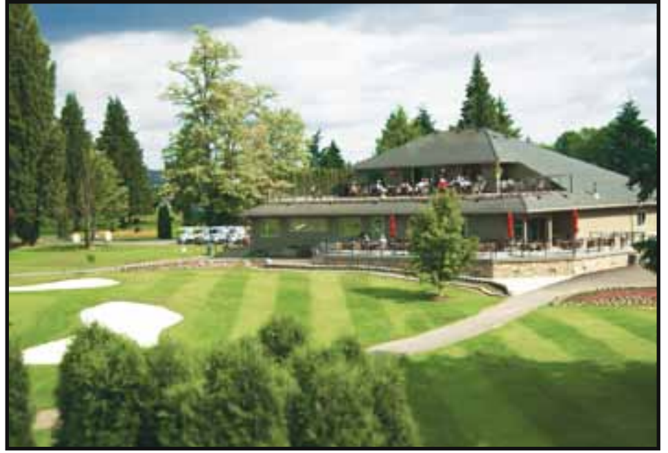
Riverside Golf Club in Chehalis has a popular roof-top bar overlooking the course.

In the Kelso area, it takes a little work to get to Three Rivers and Mint Valley, but both are 18 holes and good public tracks just a short drive off Interstate-5. Three Rivers was built on a base of material deposited in the Cowlitz River by the 1980 eruption of Mt. St. Helens and removed by